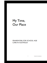
My Time, Our Place; Framework for School Age Care in Australia

Critical reflection: Reflective practices that focus on implications for equity and social justice ( Early Years Learning Framework – refer to Sources ).